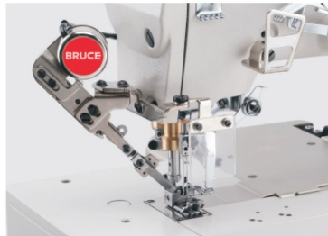
自动剪线，省人省线 Auto thread trimming

特性：稳定，高效，自动化 Stable, automatic and high efficiency