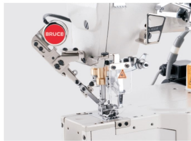
自动剪线，省人省线 Auto thread trimming

特性：稳定，高效，自动化 Stable, automatic and high efficiency