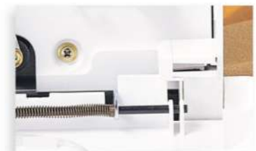
Safety switch :

Detachable extension plate for free arm sewing