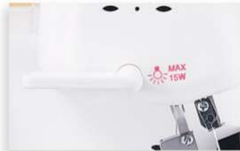
Built-in sewing lamp