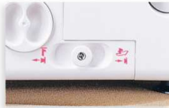
Built-in upper knife clutch device