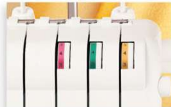
Built-in tension adjusting device