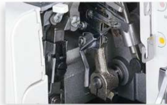
Auto looper threader