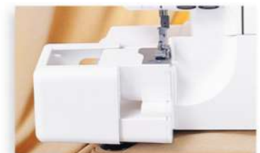
Free arm :

Detachable extension plate for free arm sewing