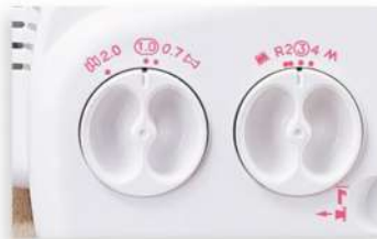
Differential and stitch length knobs