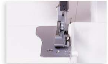
Built-in rolled hem :

To ensure all 3 threads can be inserted in the discs. You can also remove the finished work piece without the interruption on tensions.