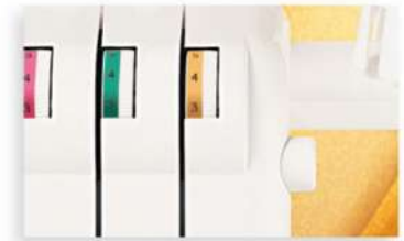
Tension release :

To ensure all 3 threads can be inserted in the discs. You can also remove the finished work piece without the interruption on tensions.