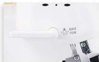
Built-in sewing lamp

Built-in rolled hem : No need to change the needle plate