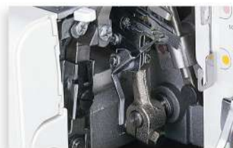
Auto looper threader

Free arm : Detachable extension plate for free arm sewing