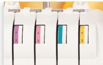
Built-in tension adjusting device

Tension release : To ensure all 4 threads can be inserted in the discs. You can also remove the finished work piece without the interruption on tensions.