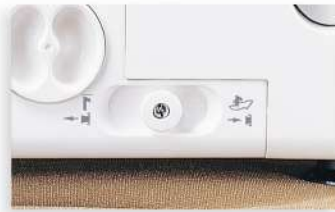
Built-in upper knife clutch device