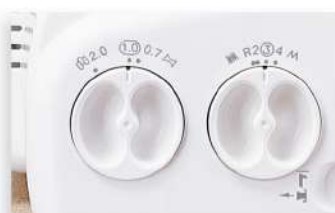
Differential and stitch length knobs

Safety switch : To prevent any danger while looper cover is opened