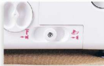
Built-in upper knife clutch device