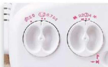
Differential and stitch length knobs

Safety switch : To prevent any danger while looper cover is opened