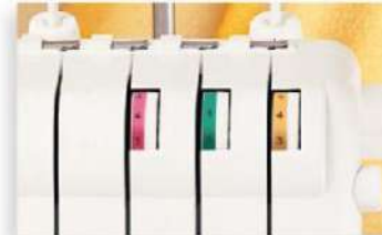
Built-in tension adjusting device

Tension release : To ensure all 3 threads can be inserted in the discs. You can also remove the finished work piece without the interruption on tensions.