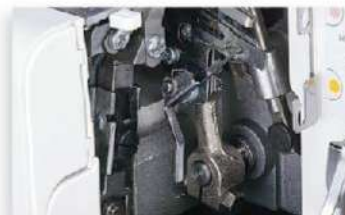
Auto looper threader

Free arm : Detachable extension plate for free arm sewing