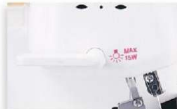
Built-in sewing lamp

Built-in rolled hem : No need to change the needle plate