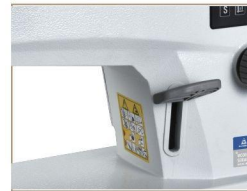
倒缝扳手前移，方便操作 Backpedal padal fronted, friendly - operate.