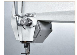
新款LED灯，带补针功能 New LED light switchwith stitch-add switch