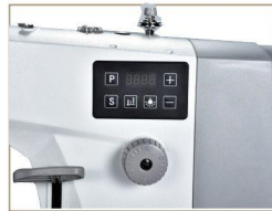
一体型电控 Highly integrated control system