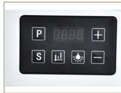
内嵌式操作面板，操作更加简便 Built-in Control Panel